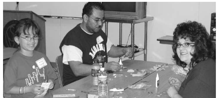
The Espinosa family working together at the June Hearts & Hands Day.