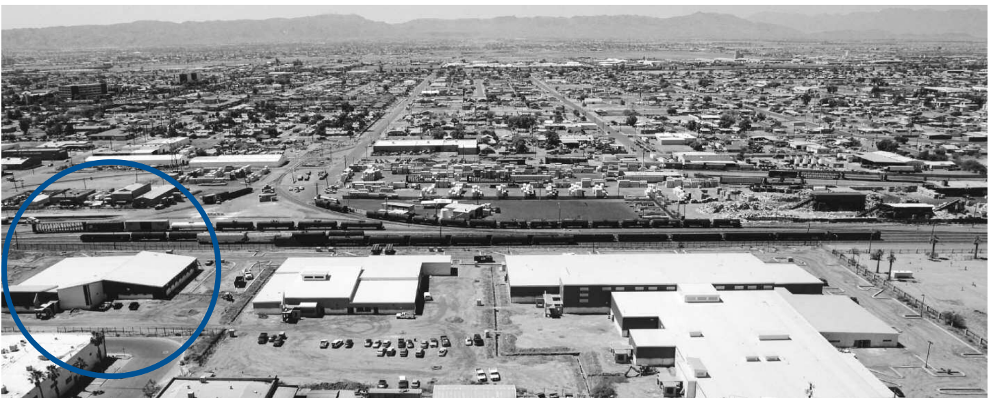
The Human Services Campus will open in November. St. Vincent de Paul’s new facilities – including a new dining room, chapel, barber shop, and office space are circled in blue. The new dining room is located at 1075 W. Jackson Street.

The Human Services Campus will be completed in November. St. Vincent de Paul, Nova Safe Haven, St. Joseph the Worker, and Maricopa County Healthcare for the Homeless will provide collaborative services for the homeless and working poor.