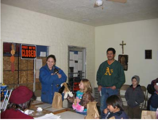
St. Francis of Assisi of the Catholic Community of Winslow