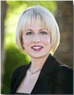
Kyrsten Sinema Democrat District 15