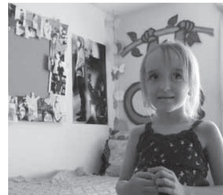
The girls' room was decorated in pink with posters of their favorite pop stars.