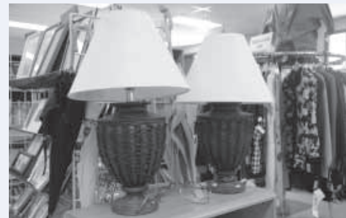
A pair of lamps with woven wood base.