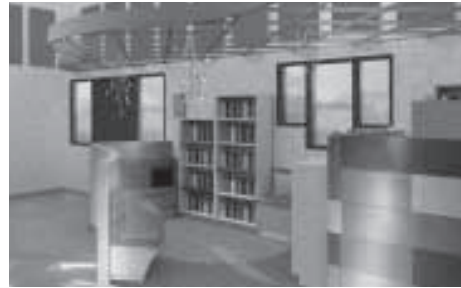
A conceptual sketch of the Dream Center – Toddler Area, Study/Library Area, and Teen Area.

for someone to help them believe that something is possible. The Dream Center is so kids can have one moment, one glimmer of hope to set them on the right path."