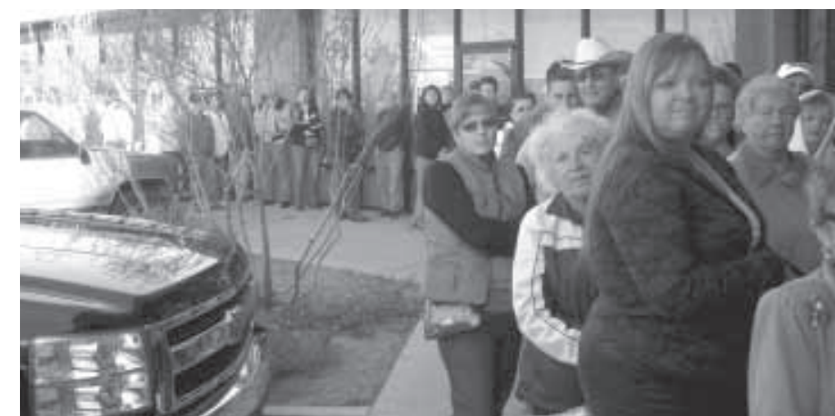
Hundreds of customers line up to get inside the store.