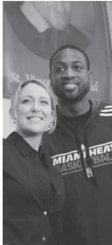
Cristie Kerr and Dwyane Wade graciously pose for pictures while passing out bags of goodies to families.