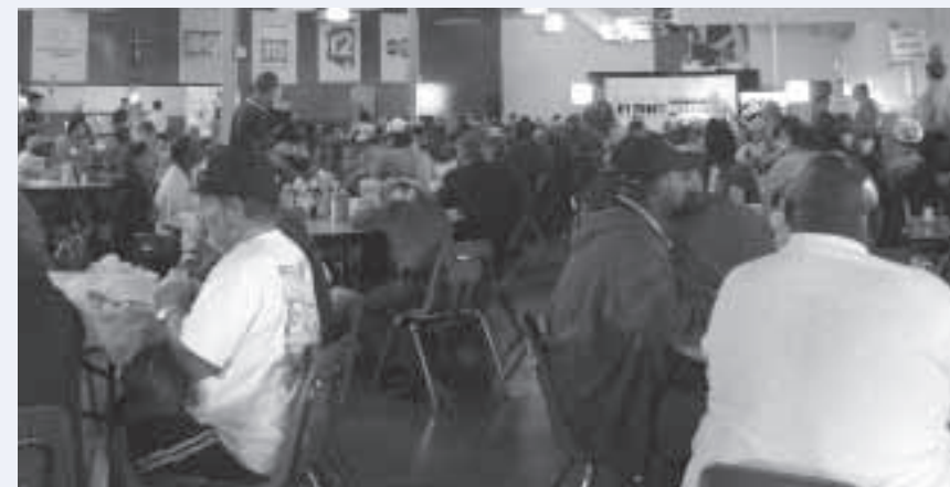
SVdP's Phoenix dining room serves breakfast to nearly 500 homeless men and women every day.