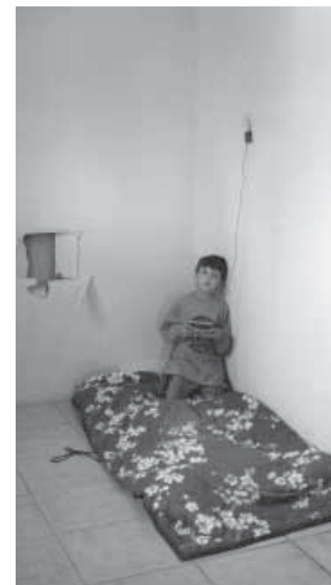
The family had very little furniture and some of the children slept on the floor.