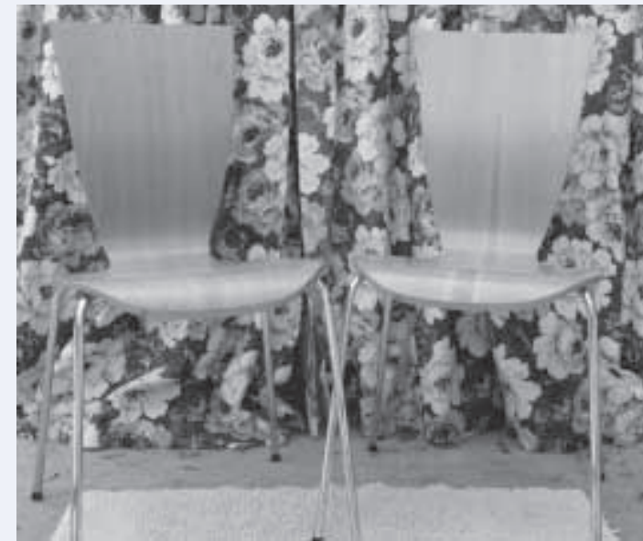
A set of modern chairs, perfect for paring with a simple kitchen table.

As always, all of your donations and purchases help fund our other services for homeless and working-poor families. If you have large items to donate and need a pick up, call (602) 254-3338.