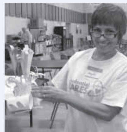
A Prudential employee makes Easter centerpieces in our family dining room.

Special thanks to those who donate items to our thrift stores! Retail profits from our stores all go to fund our services to assist homeless and working poor families. If you'd like to schedule a pick up for your donation, please call (602) 254-3338.