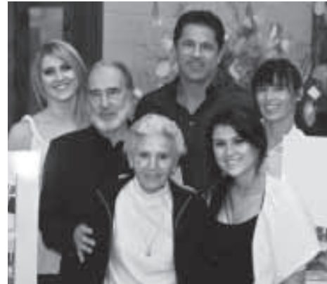
The Parker family.

Hundreds of children and their families come to St. Vincent de Paul's Hall of Banners dining room every weeknight for nourishing meals and family-oriented activities. Children can be seen in the play area throughout dinner time creating art projects, reading and getting help with their homework from volunteers.