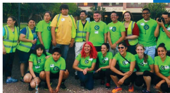
Above: Graduates of Every Little Step Counts started a running club called Vinny's Kids. The group trains for and participates in 5K and 10K walks and runs to stay healthy year-round.

The Family Wellness Program is recruiting for the second round of their study, Every Little Step Counts Program for Latino youth between the ages of 14-16 who meet the guidelines for obesity. For more information, contact the Family Wellness Program at 623-850-1143.