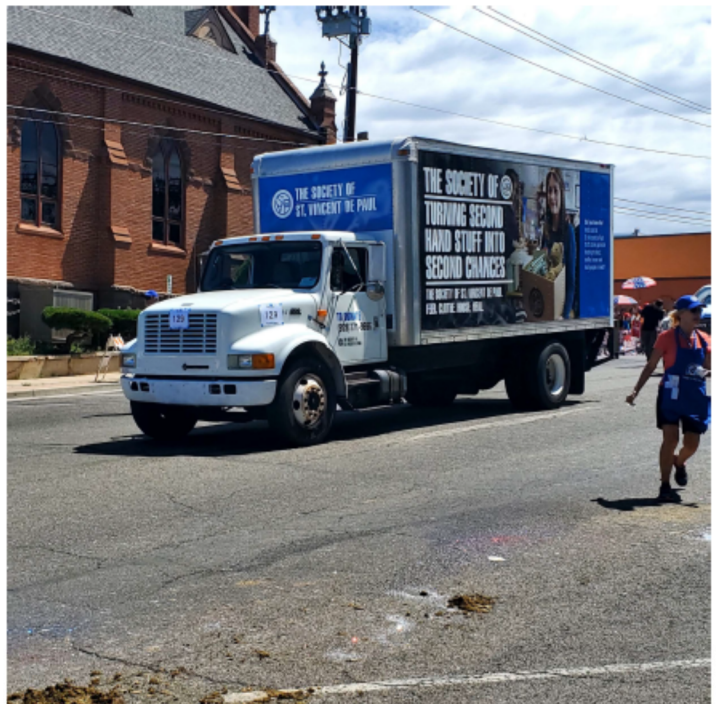
The recently "re-wrapped" Thrift Store truck provided great promotion for the store as well as the conference.