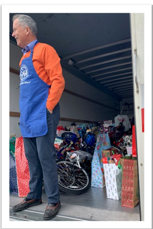
St. Bernard recently had a very successful Christmas Gift Drive