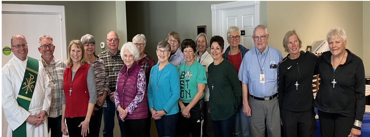
Jubilarian Celebration January 16, 2024

And these Jubilarians intend to keep on offering that service!